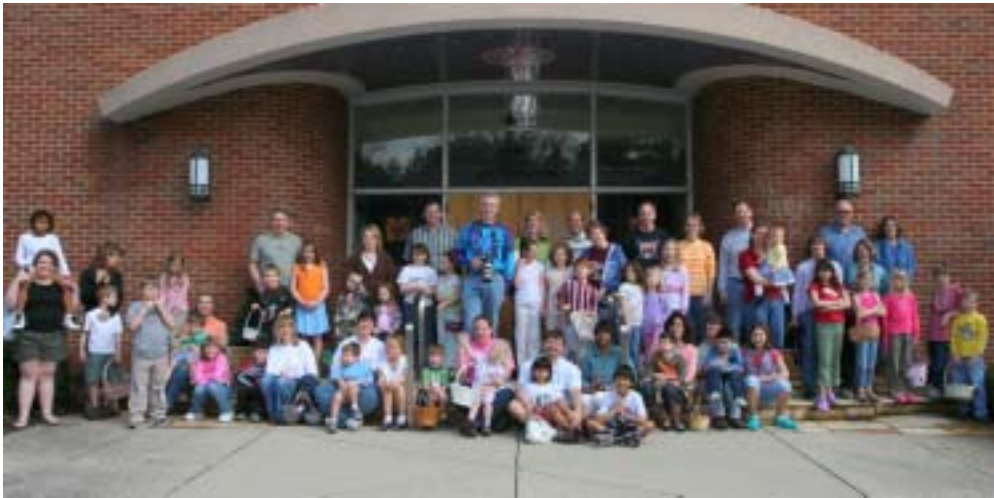
A great turnout for the annual Easter Egg Hunt.