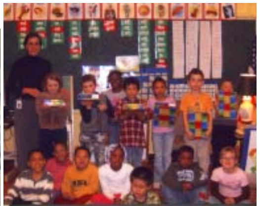
A very appreciative first grade class at Patterson-Kennedy School for the school supplies.